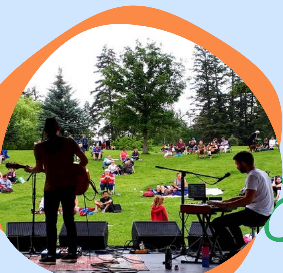
2022 Performances in the Park

Our biggest thanks extend to our event sponsors that support our event and to our municipal partners (Cariboo Regional District and the City of Williams Lake) that provide several aids beyond our core funding. A special round of applause for our event patrons coming to our beautiful park on Thursday nights in the summer to share the sounds and joy of creative live performance and community! The CCACS also wishes to thank the Community Arts Council of Williams Lake for their continued professionalism, innovation, and outstanding efforts that are instrumental in Performances in the Park!