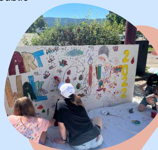
2022 Art Walk Opening Reception

increase in approved applications from 2021