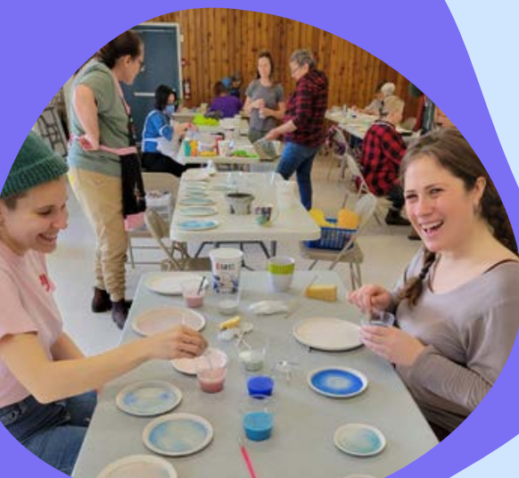
Cariboo Potters' Guild 2022 grant funded workshop

The Central Cariboo Arts and Culture Society was pleased to see a year of quality applicants and increased applications that expressed requests for diverse projects from both new and returning applicants. We were very pleased to fund projects and purchases that contribute to the arts and culture experience in our region and support practicing artists through those initiatives. Successful applicants presented and carried out several different activities and offerings: support for the purchase of public art and operational equipment; historical projects and public concerts; for art classes and initiative awareness through art.